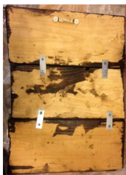
Mending Plates and Hanger Placement