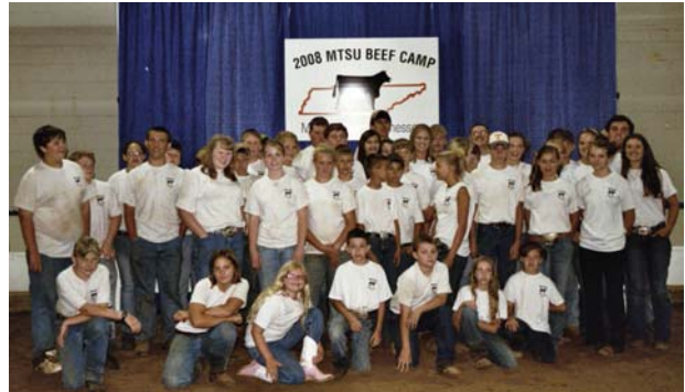
Campers to MTSU's Beef Camp are all smiles.