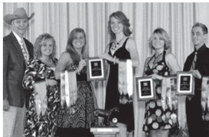
The MTSU horse judging team won all three divisions and the overall top award at the American Quarter Horse Congress horse judging contest held in Columbus, Ohio, on October 14.