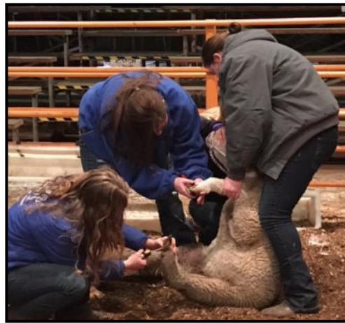
Students trimmed sheep hooves during the lab practicum that was held at the University of Tennessee Agricultural Experiment Station.