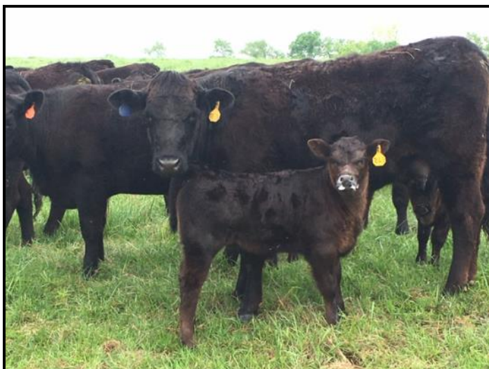
A SimAngus cow/calf pair at the MTSU Beef Unit.