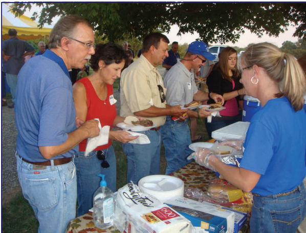
Lots of food was, again, a Field Day highlight.